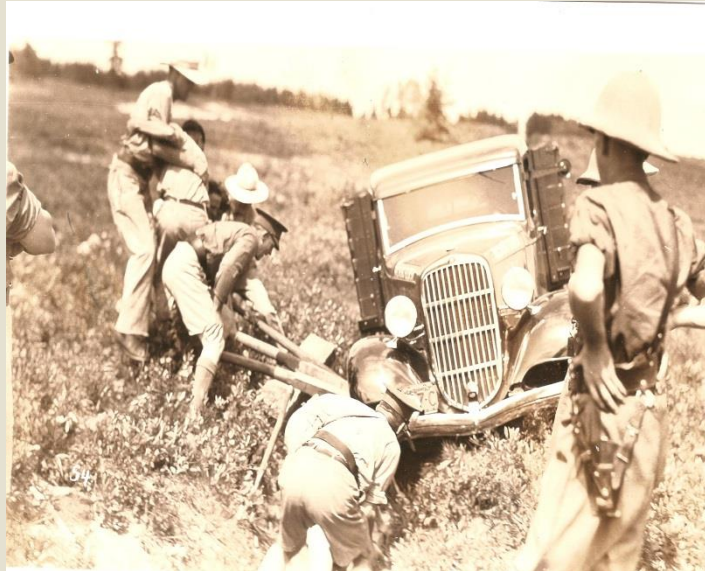
Canadian Army Training School