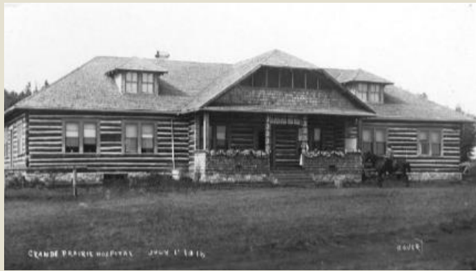
City of Grande Prairie Cemetery Walking Tour