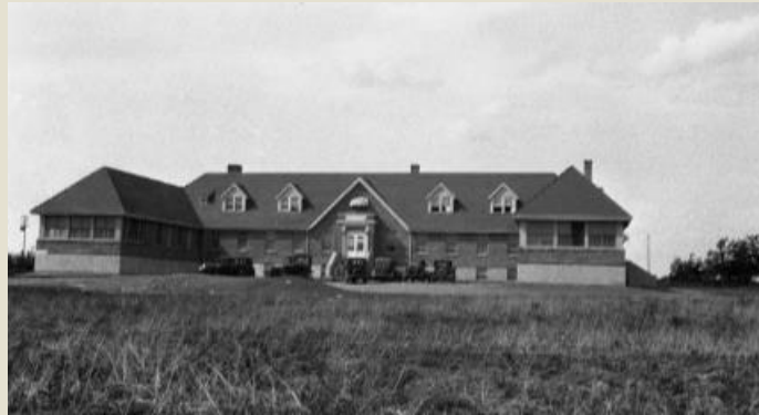
City of Grande Prairie Cemetery Walking Tour