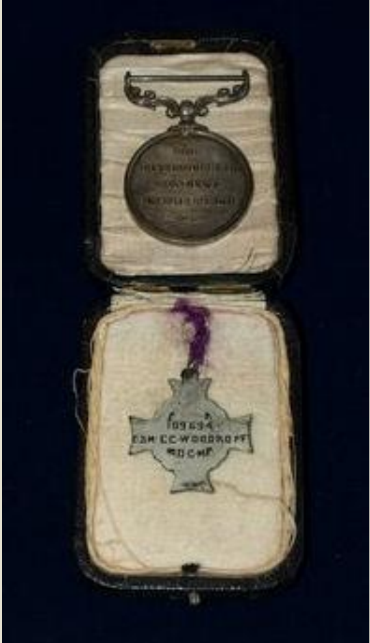
4 th Canadian Mounted Rifles