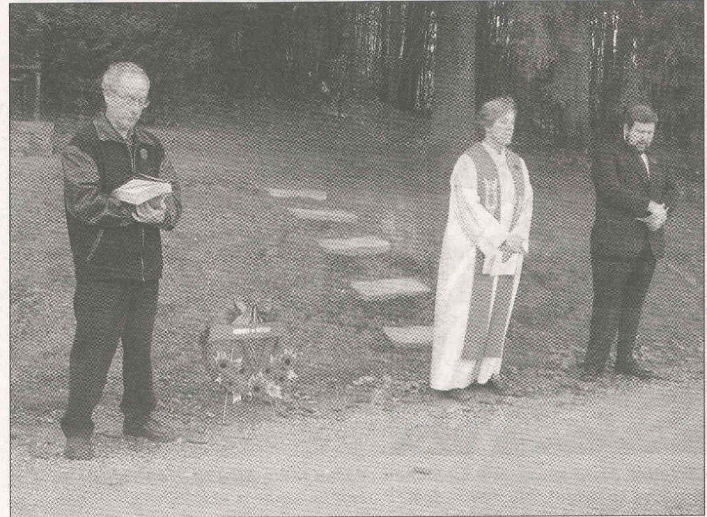
A service to honour Remembrance Day was held at Kettleby Cemetery this past Sunday.